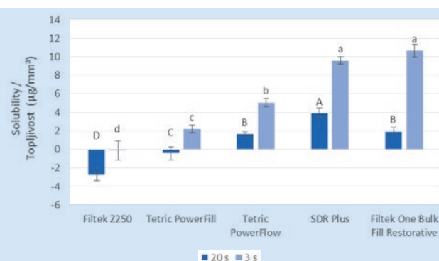
Figure 3 Comparison of solubility between control group of polymerized specimens and 3s polymerized specimens. The same letters (20 s uppercase, 3 s lowercase) indicate statistically homogeneous groups within the illumination protocol. There is a statistically significant difference when comparing the 3 s and 20 s polymerization protocols within the same material. Error bars show \pm 1 standard deviation (due to low variability within the thickness of whiskers).

Slika 2. Usporedba apsorpcije vode između kontrolne skupine polimeriziranih uzoraka i 3 sekunde polimeriziranih uzoraka; ista slova (velika za 20 s, mala za 3 s) označavaju statistički homogene skupine unutar protokola osvjetljavanja; statistički slični parovi između skupina (20 s vs. 3 s) označeni su uglatim zagradama, stupci pogreške pokazuju \pm 1 standardnu devijaciju (zbog male varijabilnosti, unutar debljine crte)