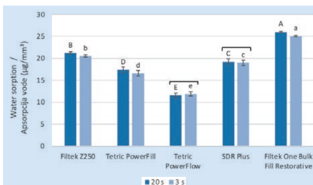
Figure 2 Comparison of water sorption between control group of polymerized specimens and 3s polymerized specimens. The same letters (20 s uppercase, 3 s lowercase) indicate statistically homogeneous groups within the illumination protocol. Statistically similar pairs between groups (20 s vs. 3 s) are indicated by square brackets. Error bars show \pm 1 standard deviation (due to low variability within the thickness of whiskers).

Na slici 4. su uzorci materijala Tetric Power Flow i SDR Plus koji su postigli „plato” promjene mase tijekom imerzije već nakon dva tjedna, dok drugi materijali to nisu postigli u